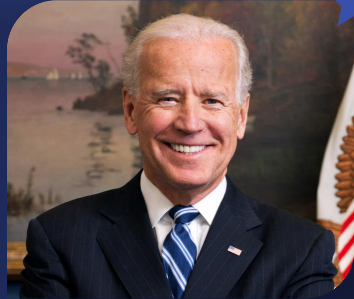
FORMER VICE PRESIDENT JOE BIDEN